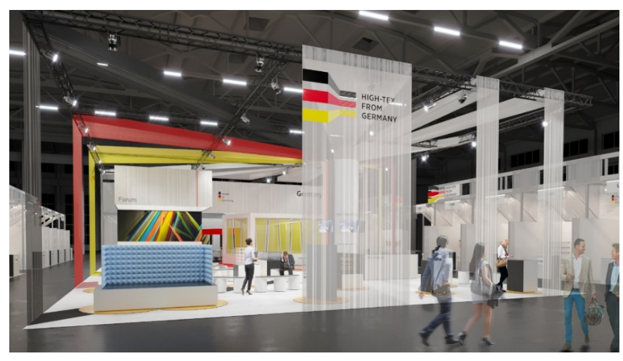
'Hightex-from Germany' presents textile innovations from Germany